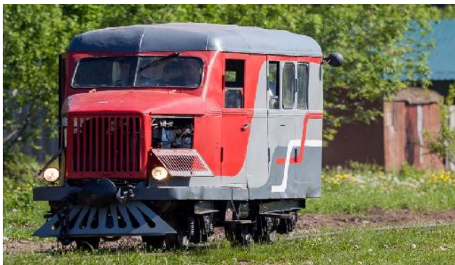
The PD1 railbus of the Tesovo railway museum

The enthusiasts' project, the Tesovo Narrow Gauge Railway, has been developing over the last decade and is based on Tesovo-1. Its basic aim is to preserve and present a traditional peat railway. Currently it has at its disposal about 200 metres of track, a TU4 locomotive, a PD1 railbus, and several motor-trolleys.