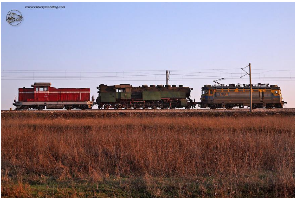
En route to Sofia

Several tourist operators showed quite a strong interest in the restoration of the locomotive 46.03. BDZ agreed to check the possibility for the restoration and sent a team of experts to pre-evaluate the technical condition of the locomotive at the Asenovo depot during the autumn of 2013. The results were satisfactory - the locomotive was almost fully equipped and with minor defects. It later appeared that it had passed a factory repair, after which it worked less than half a year! Based on this, the decision to move the locomotive to Sofia and start the restoration was taken. On 12 March 2014 locomotive No.46.03 was pulled out from Asenovo and took the long way to Sofia for restoration.