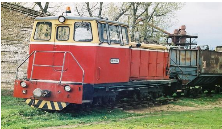
A TU6 locomotive of the Tesovo peat enterprise

The nearest station is Rogavka. The terrain is marshy, this being a peat area which in Soviet times supplied power stations serving, among others, Leningrad. The origin and main centre of the line was Tesovo-Natyl'skii, a small town. When the peat industry spread, new settlements were also named Tesovo, each with a serial number; so the Tesovo-Natyl'skii peat centre became Tesovo-1. In the 1970s the line was modernized and could boast concrete sleepers and semaphore signals. A passenger service operated between Tesovo-1 and Tesovo-2. By this time the steam locomotives were being replaced by a stock of more than 30 diesel and motor traction units.